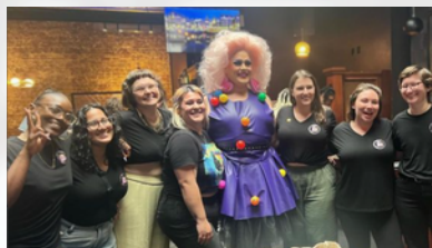
Abortion, Spice & Everything Nice Artisan Market Fundraiser (right)